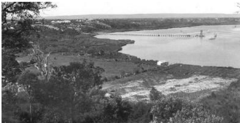
New Jetty, Circa 1913

The jetty has been in its current position for over 103 years now - albeit very much shorter today than in 1913. It was built out to mid stream over 100 years ago due to the low water depth and this enabled the beginning of organised sailing events with the formation of the inaugural Maylands Sailing Club. It was again shortened after dredging of the channel, but by 1932, vandals had damaged it removing the planking and "rendering it unfit for use" as reported by The Daily News. The hardwood planks would have been highly