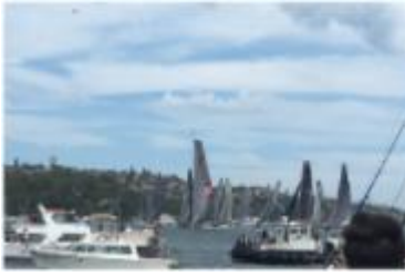
Editor at Large - my pic from Bradleys Head

It is always great to tick another item off the bucket list - and watching the start of a Sydney to Hobart Yacht Race up close on the line was one of mine. Well, I got to experience it last Boxing Day and it was one to catch with Wild Oats, Comanche and the other super maxis charging down towards the Bradleys Head end of the line where our spectator boat was anchored. Definitely no place for the faint-hearted, but a spectacle to remember for the ages.